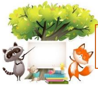
Mon 3yo Bush Kinder